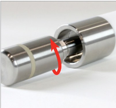
3. Unscrew the HiTemp140-M12 data logger, from the lid of the thermal barrier.