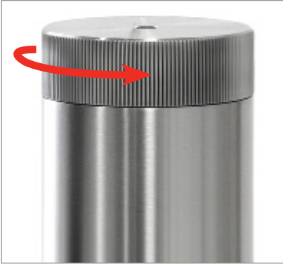
1. Unscrew the lid of the thermal barrier.