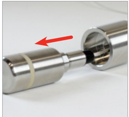
4. Slide the probe of the data logger out from the lid of the thermal barrier.