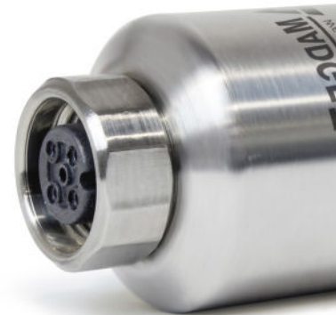
Closeup of the M12 Connector