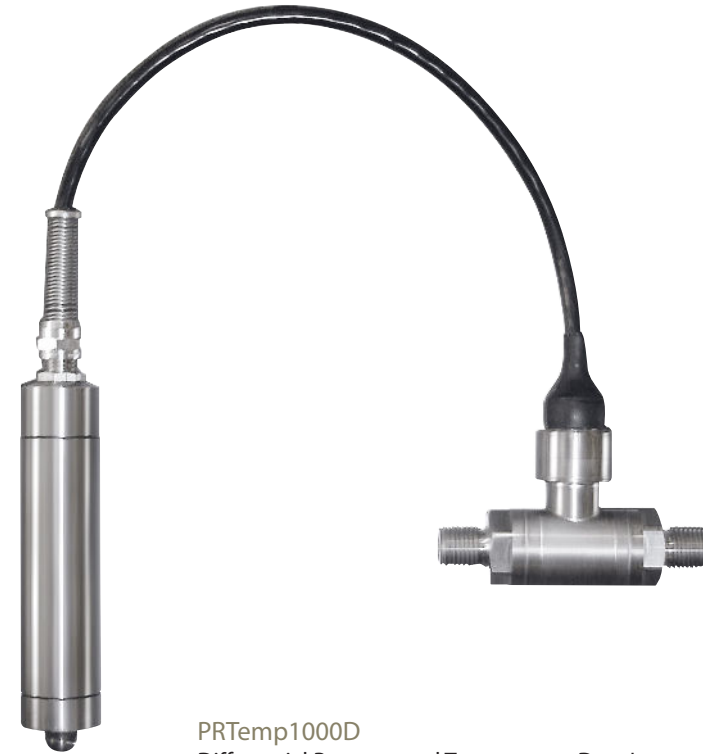
PRTemp1000D Differential Pressure and Temperature Data Logger